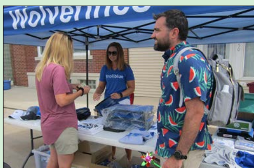
A shopper on the street wore a watermelon design shirt!