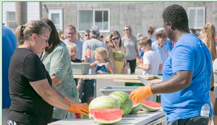
Festivalgoers enjoy some watermelon at the Annual Dike Watermelon Days.