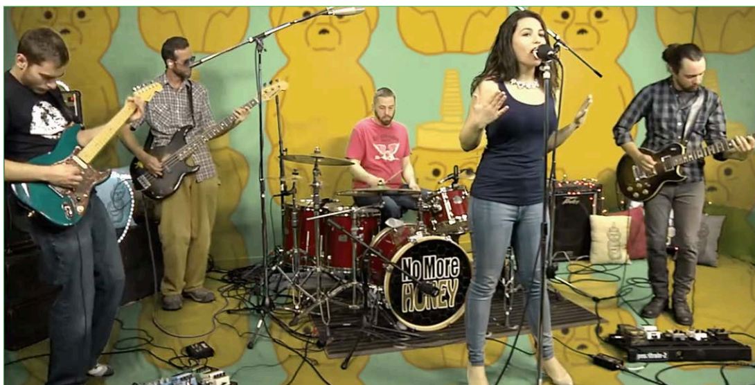
No More Honey, an Iowa City-based classic rock band, will take the stage on Thursday night during the Clock Tower Concert and Car Cruise series in downtown Grundy Center.

"This is just our kind of gig," she said. "We're small town people, and we love being a part of events like this. I hope we can