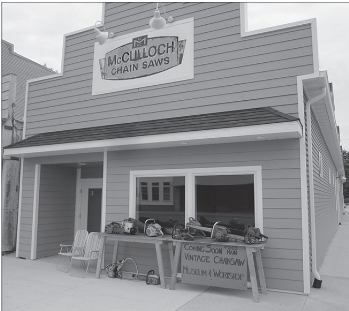
Vintage Chain Saw museum and workshop

The races are done and the food booths are taking a break