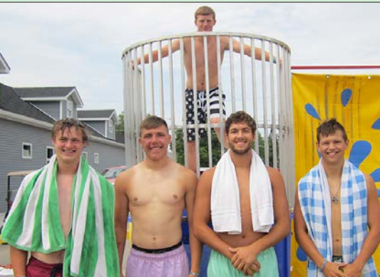
Dunk tank volunteers.