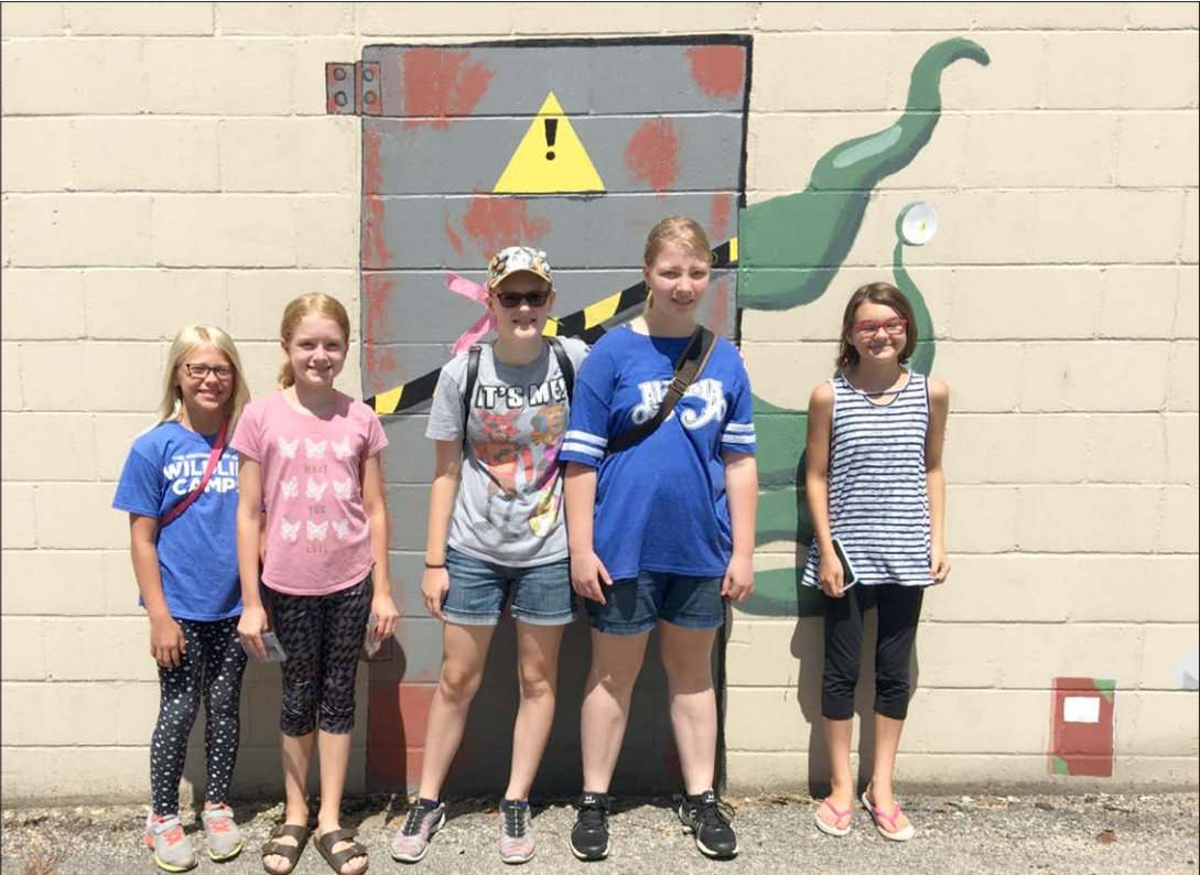
A group of local teens are taking their creativity to new levels as a part of the Creativity for Change program sponsored by Kling Memorial Library, where they have painted their very own wall mural.